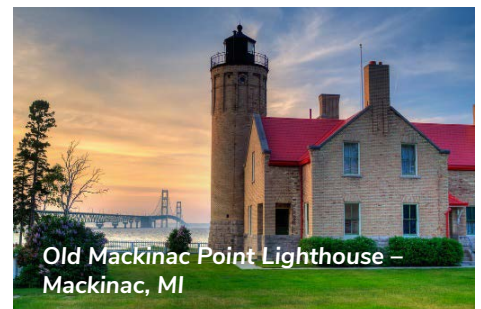
Old Mackinac Point Lighthouse – Mackinac, MI