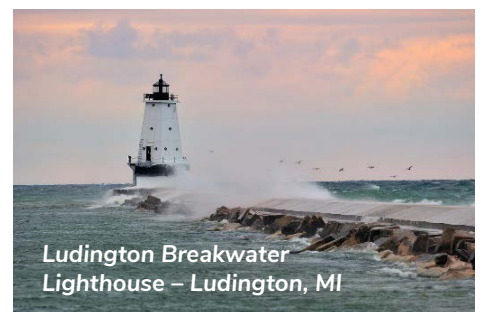
Ludington Breakwater Lighthouse – Ludington, MI

Michigan is home to more than one hundred lighthouses. Scattered along the shoreline, Michigan's lighthouses offer waypoints to those on water and are landmarks of history for those on land. Short and squat, or tall and lean, each of Michigan's uniquely-beautiful lighthouses plays its part in keeping the Great Lakes safe. With 3,200 miles of shoreline and one of the nation's most active waterways, it's no wonder that Michigan claims more lighthouses than any other state in the country.